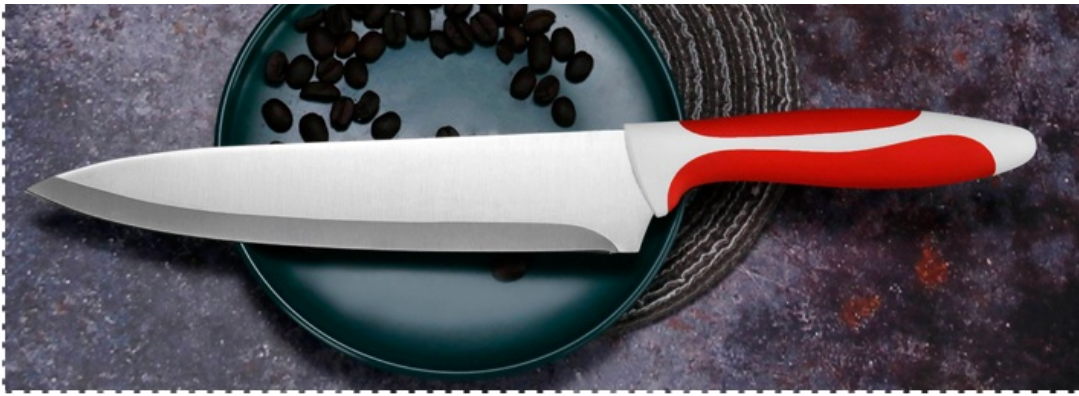
Blade THK:1.5mm, Blade W:2.7cm, Blade L:20cm, Handle L:13.3cm