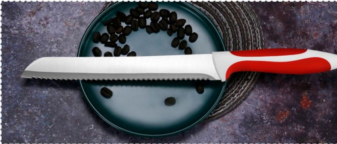
Blade THK:1.5mm, Blade W:2.7cm, Blade L:20cm, Handle L:13.3cm