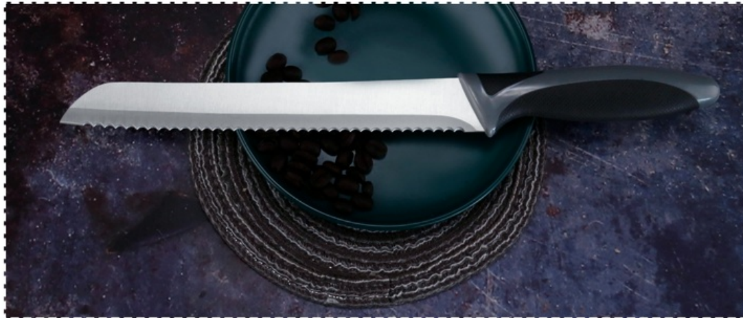
Blade THK:1.5mm, Blade W:2.7cm, Blade L:20cm, Handle L:13cm