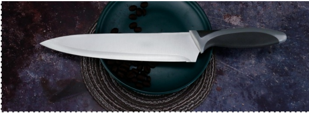
Blade THK:1.5mm, Blade W:2.7cm, Blade L:20cm, Handle L:13cm