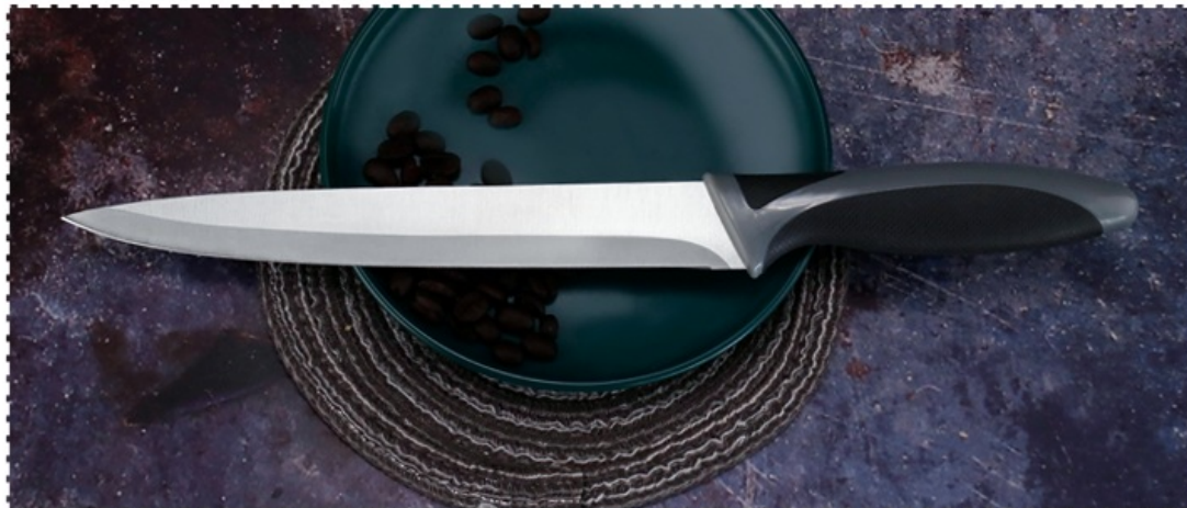
Blade THK:1.2mm, Blade W:2cm, Blade L:12.7cm, Handle L:12.5cm