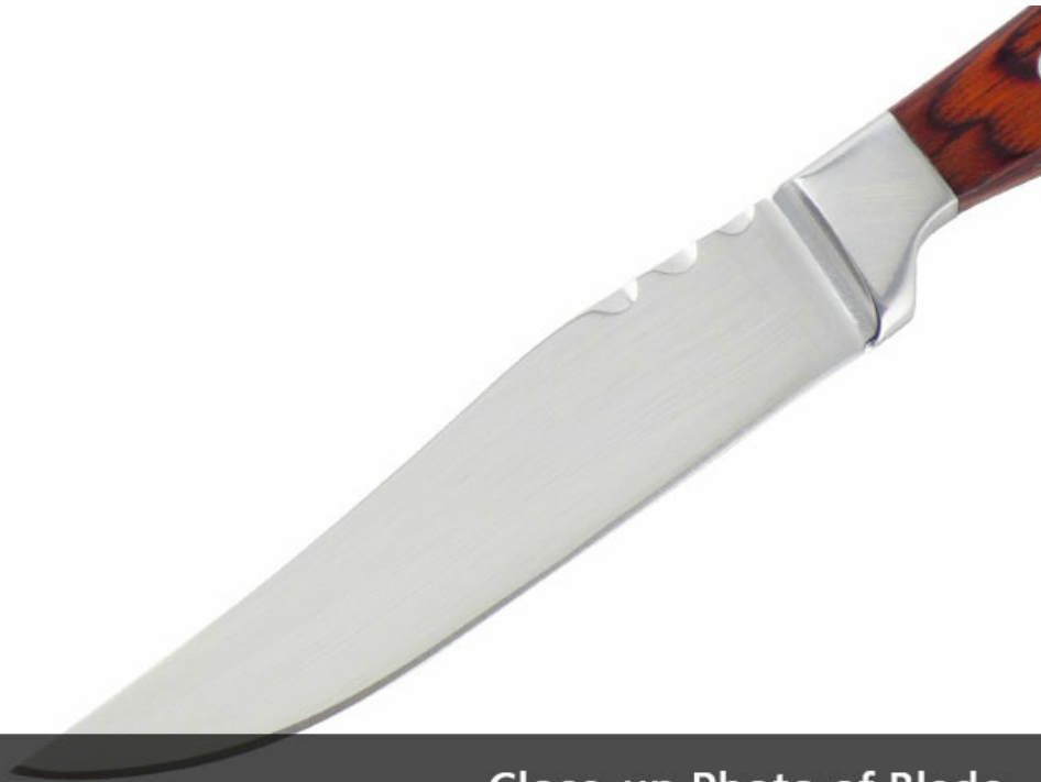
Close-up Photo of Blade