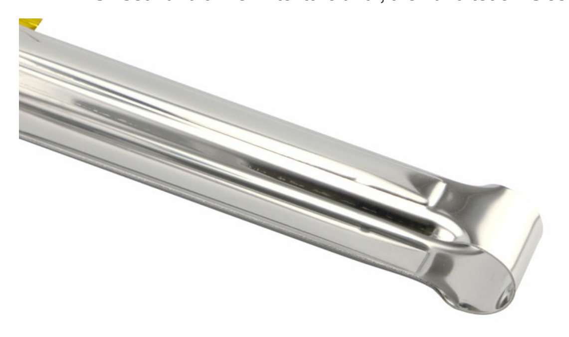
Handle is in hang hole design, organisational, convenient and comfortable.

The handle design is according with human body mechanics, smooth and uniform texture and , the hand touch is comfortable.