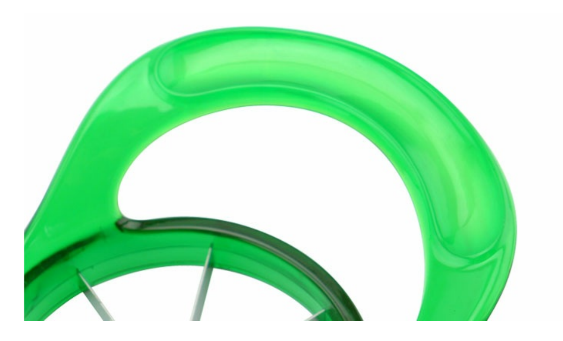
Made of high quality stainless steel, thin and sharp