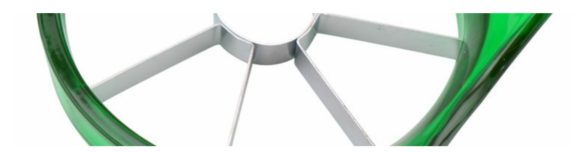
Ergonomic design ABS handle, non-slip, touch feeling is comfortable, simple and easy to use.