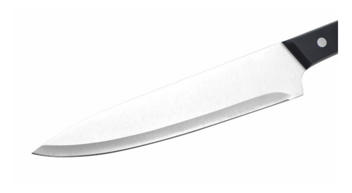
With beautiful designed handle and comfortable to hold.