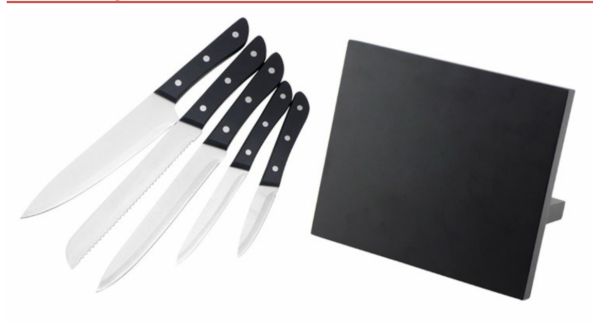
Blade is in stainless steel 3Cr13, superior performance and keep long-term sharping.