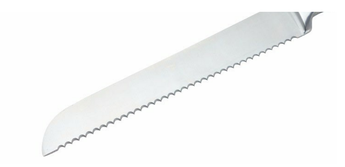
With beautiful designed handle and comfortable to hold