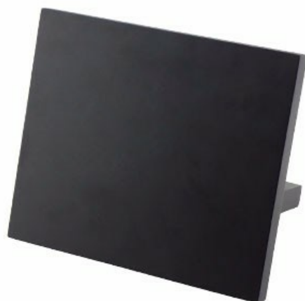
Magnetic suction cutter holder

The new design, more fashion, more beautiful!