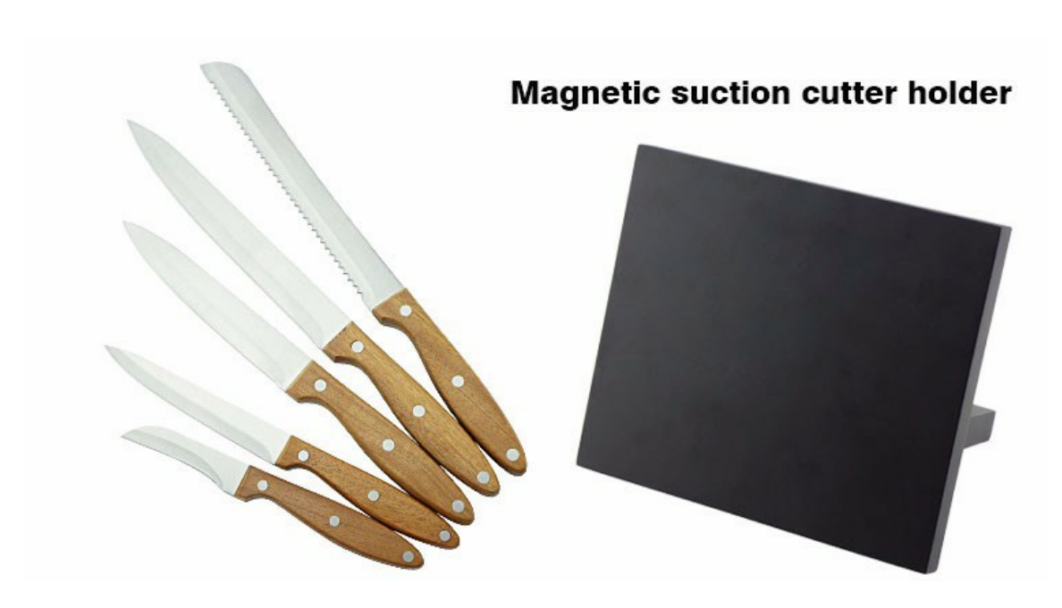
Thin serration bread knife To Reduce dropping bread crumbs