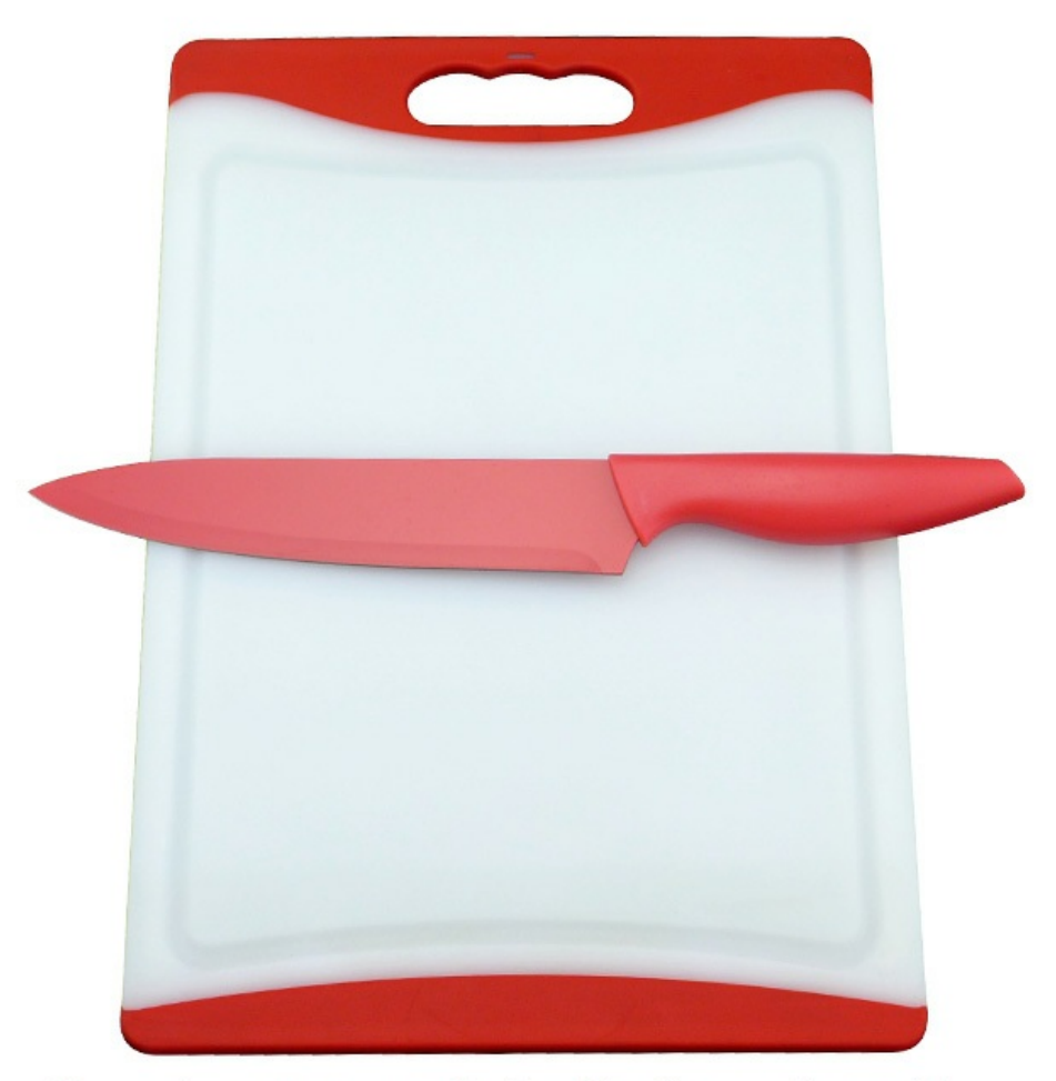
Non-poisonous, no smell, durable, fine workmanship, beautiful and elegant model