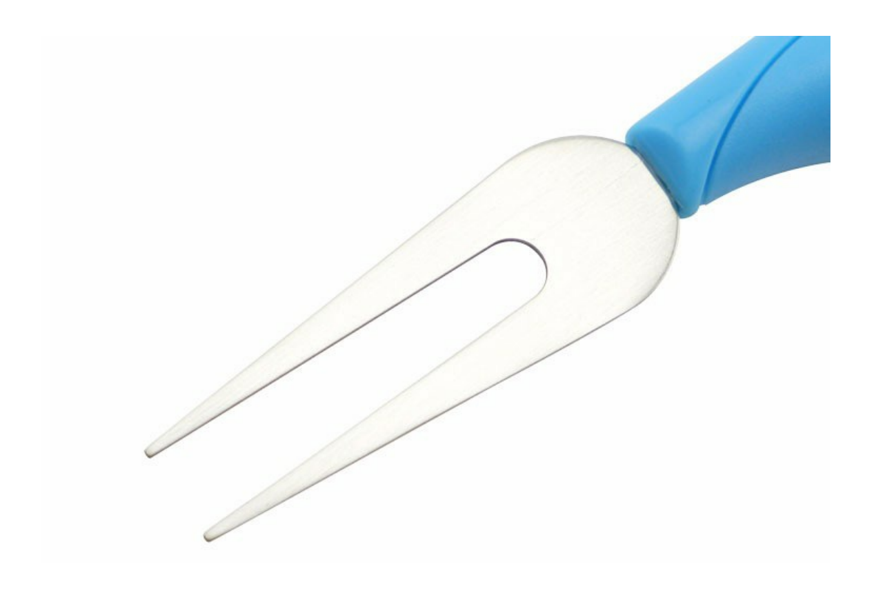
With beautiful designed handle and comfortable to hold