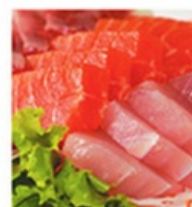
slicing of meat