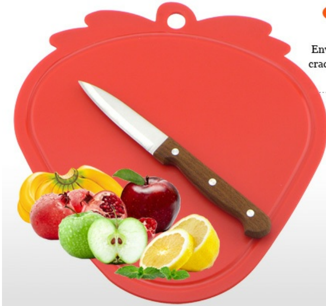
PHOTO OF GOODS