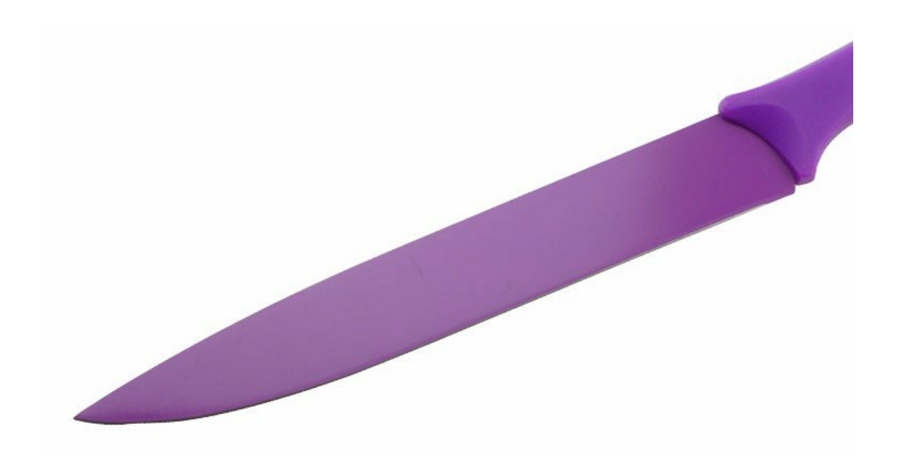
With New Fresh PP Handle and Refreshing Colors.