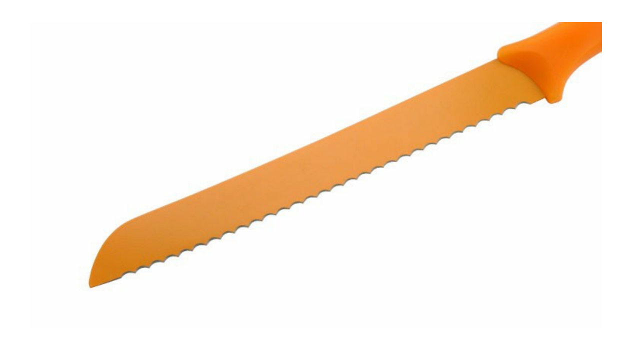
With New Fresh PP Handle and Refreshing Colors.