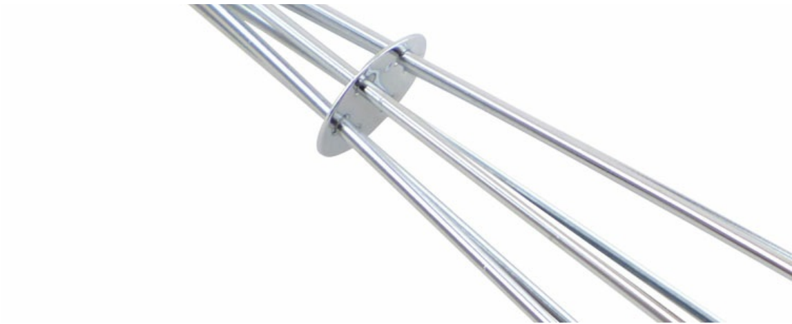
Hang hole design

bright as new, tail is in hanging design, easy to storage and save space