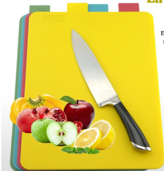
PHOTO OF GOODS