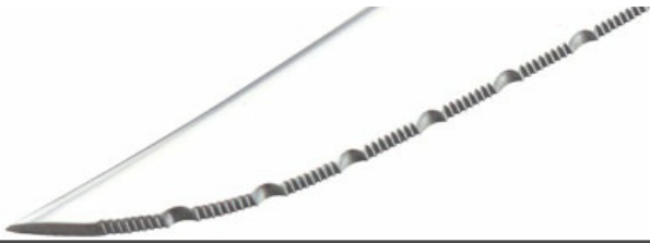
Close-up Photo of Blade

Fixed by three rivets is more stable, more comfortable and safer