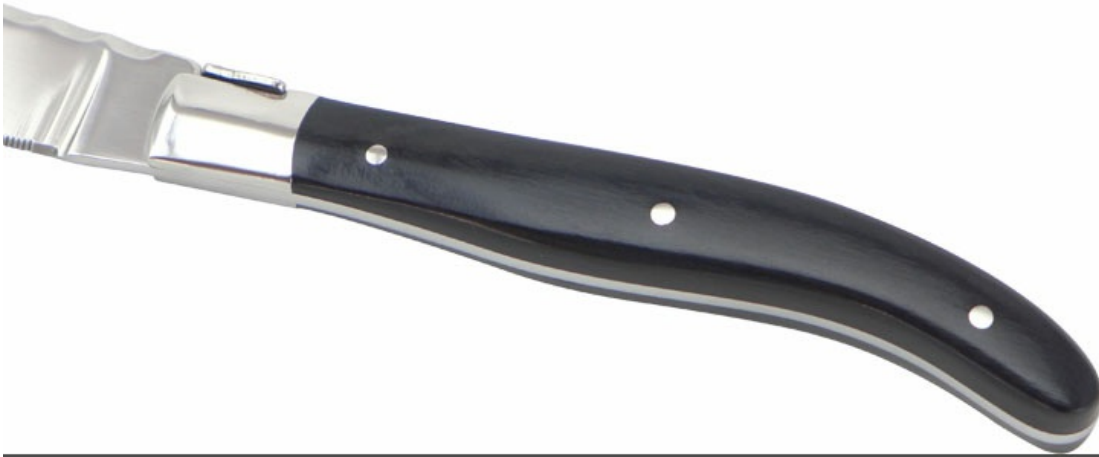
Close-up Photo of Handle

Fixed by three rivets is more stable, more comfortable and safer