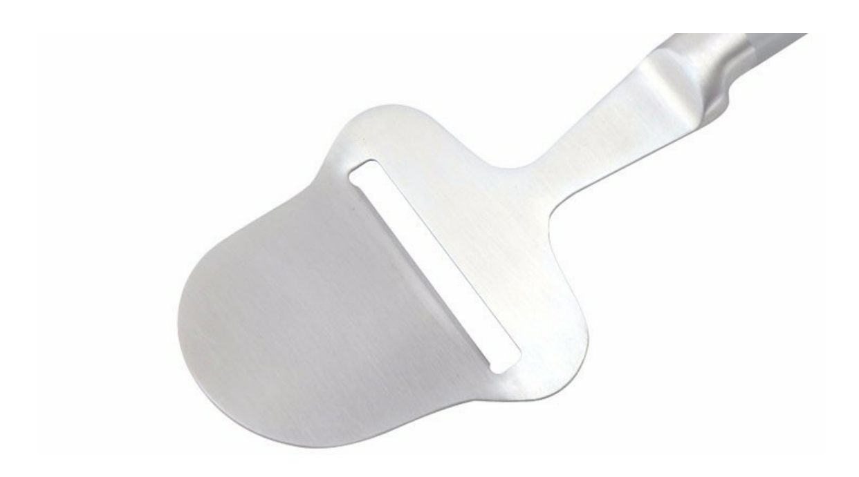
Firm and hard, elegant and beautiful