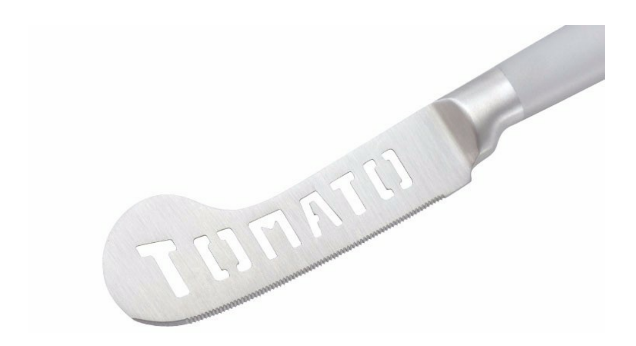
Firm and hard, elegant and beautiful