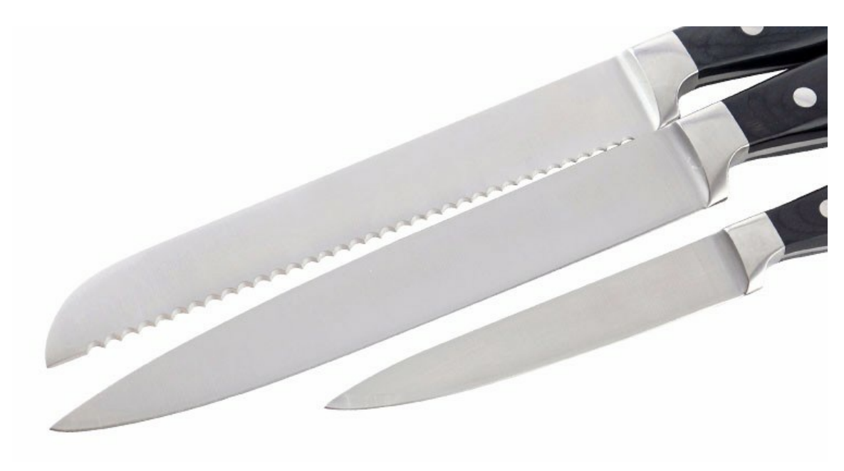
With beautiful designed handle and comfortable to hold