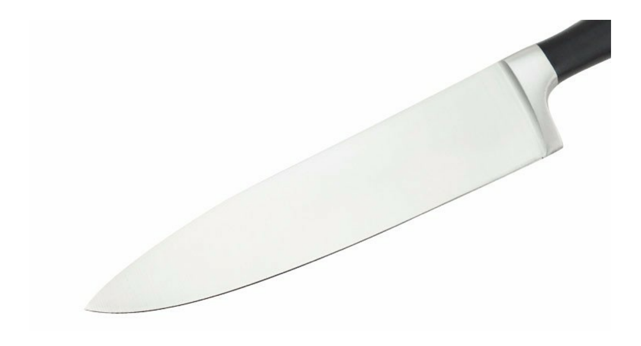
With beautiful designed handle and comfortable to hold