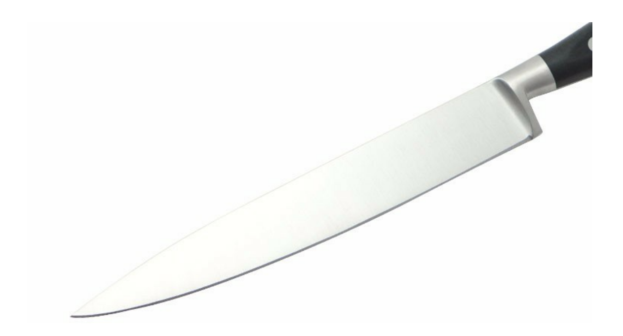
Fixed with 3 rivets, never break and crack, comfortable and anti-slip.