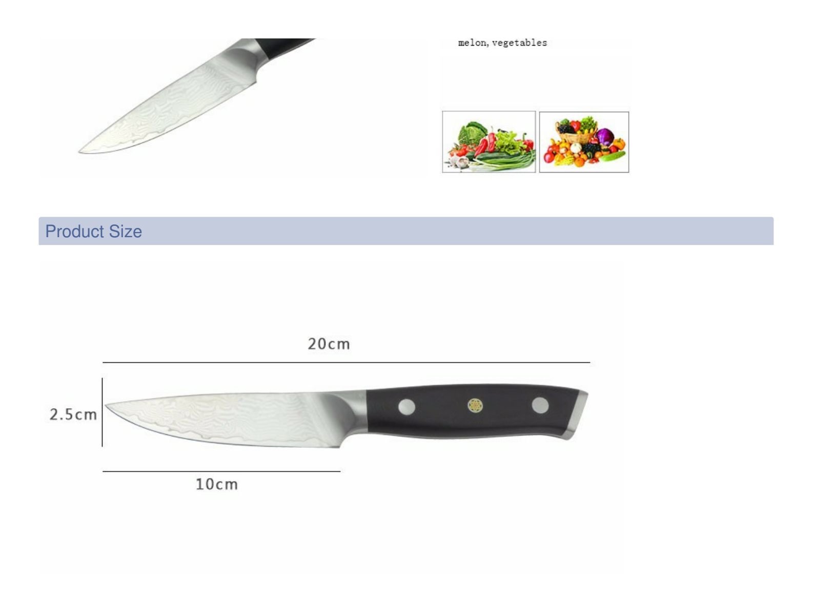
Blade THK: 1.8mm Note: Size is subject to actual sample.