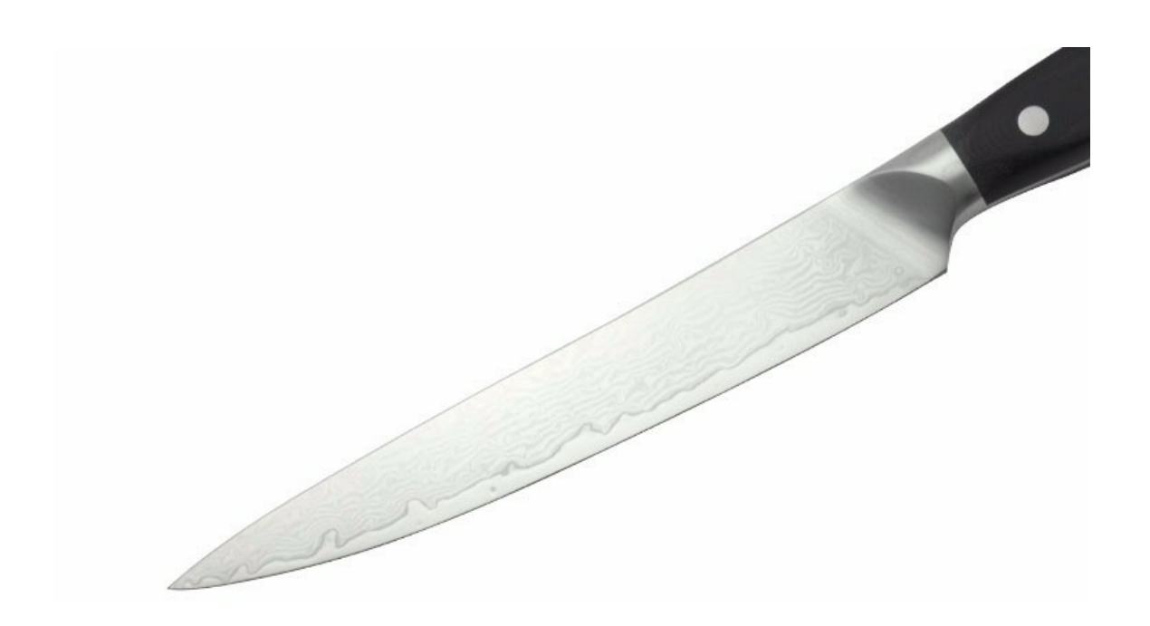
Made from #430 and G10, confortable to hold

The auspicious clouds pattern in the knife blade surface is not only vintage but also fashion, and could help to separate food very fast.