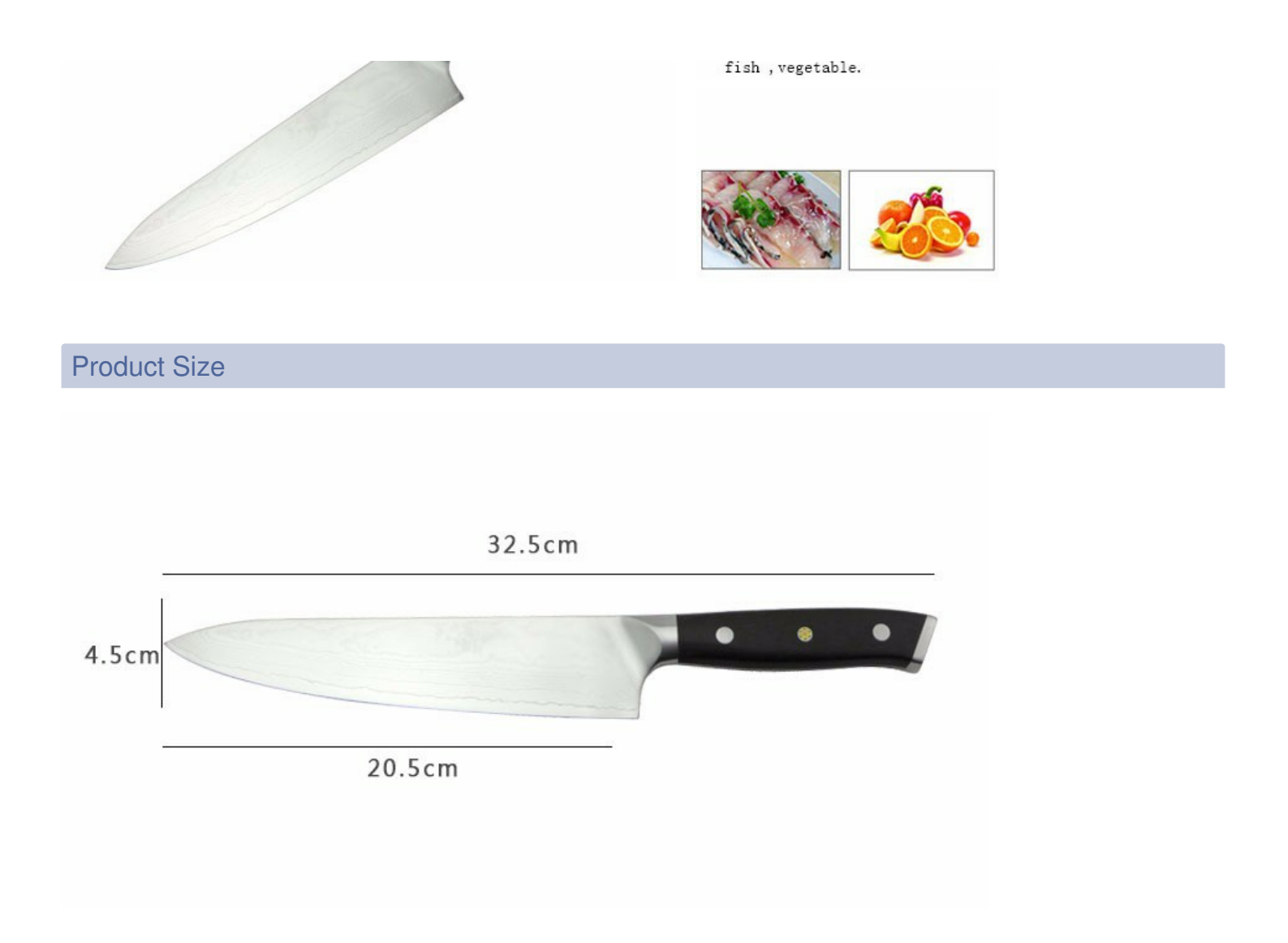
Blade THK: 2.5mm Note: Size is subject to actual sample.