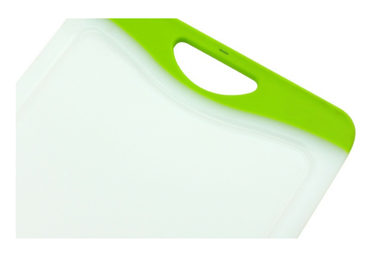
Anti-overflow Tank Humanized water-conductive design prevents juice spilling when cutting succulent food