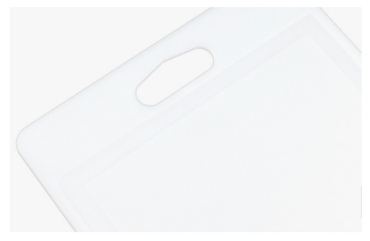
Anti-overflow Tank Humanized water-conductive design prevents juice spilling when cutting succulent food.