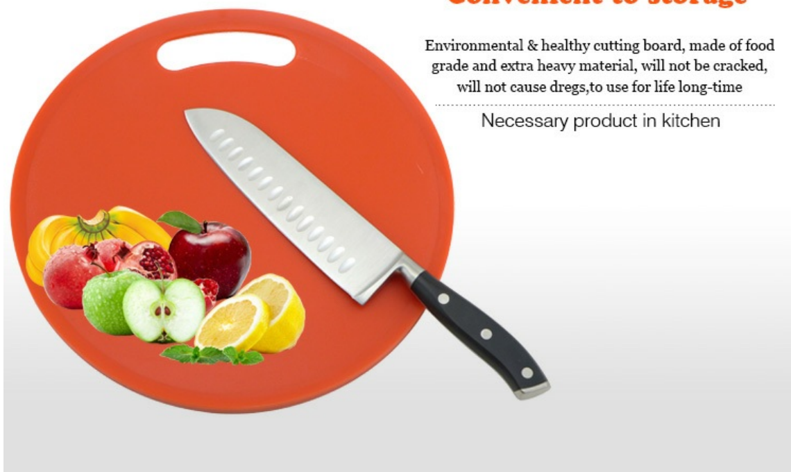
PHOTO OF GOODS