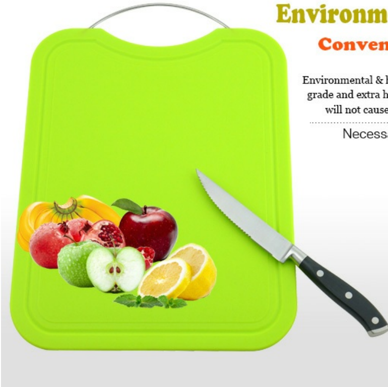
PHOTO OF GOODS