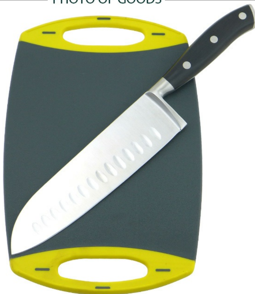
PHOTO OF GOODS

Non-poisonous, no smell, durable, fine workmanship, beautiful and elegant model