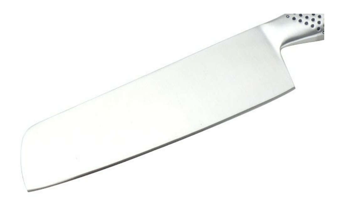
Treated at high temperature, makes the steel structure more stable and anticorrosion hard, sharp and durable.