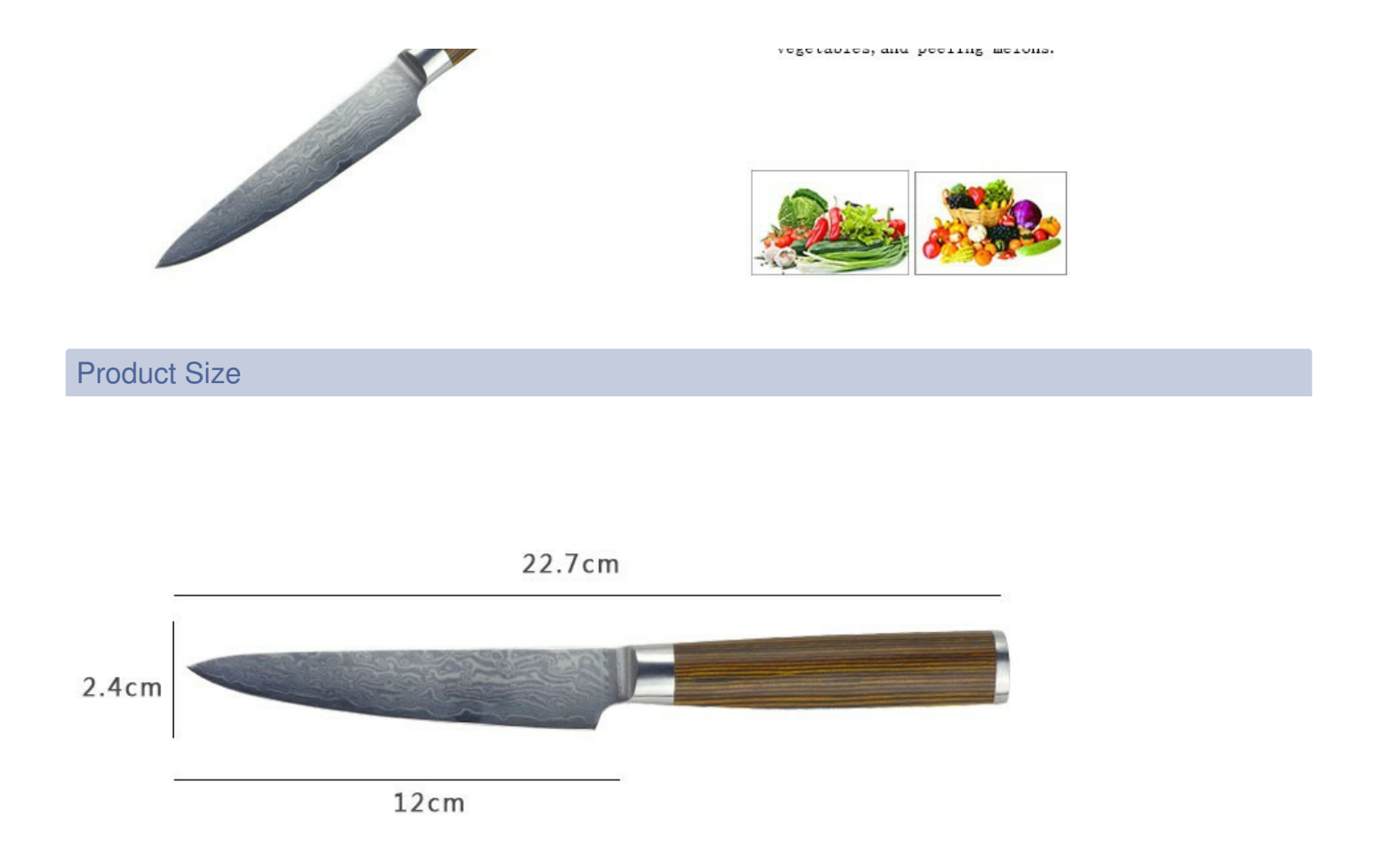
Blade THK: 1.9mm Note: Size is subject to actual sample.