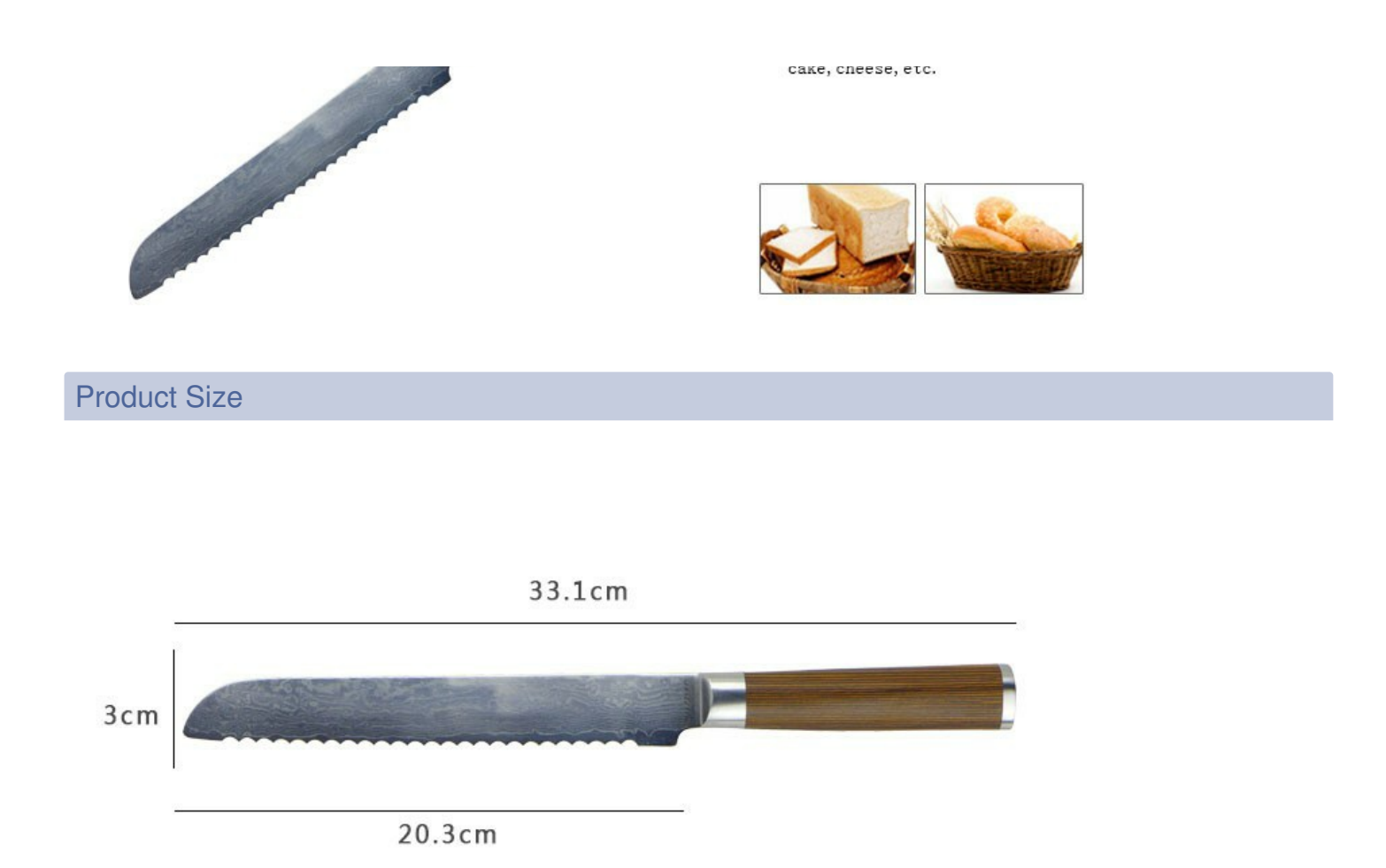
Blade THK: 2.1mm Note: Size is subject to actual sample.