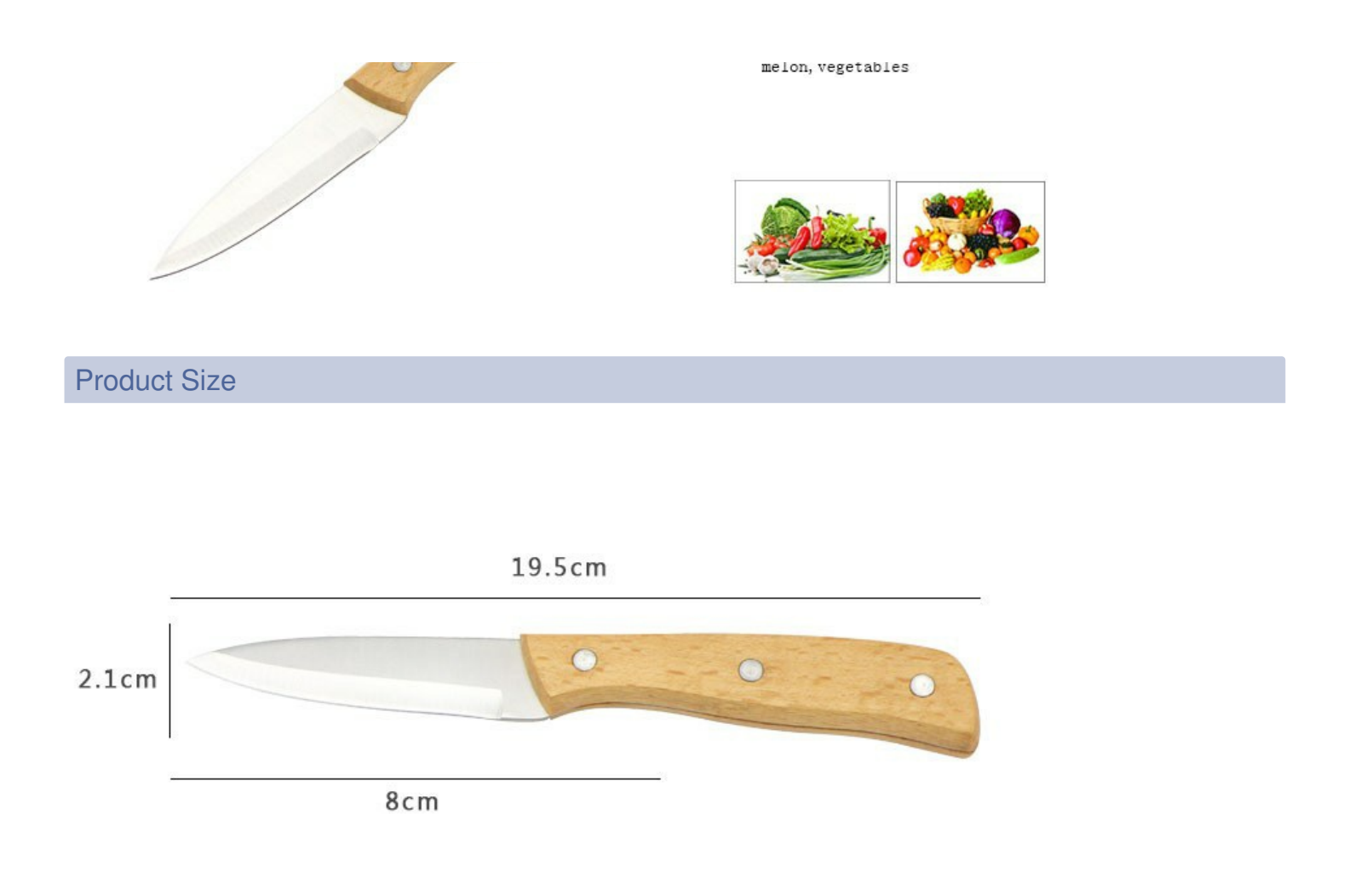
Blade THK: 1.5mm Note: Size is subject to actual sample.