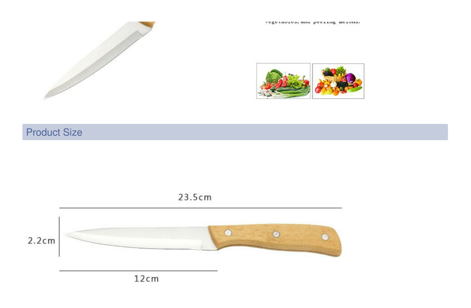
Blade THK: 1.5mm Note: Size is subject to actual sample.