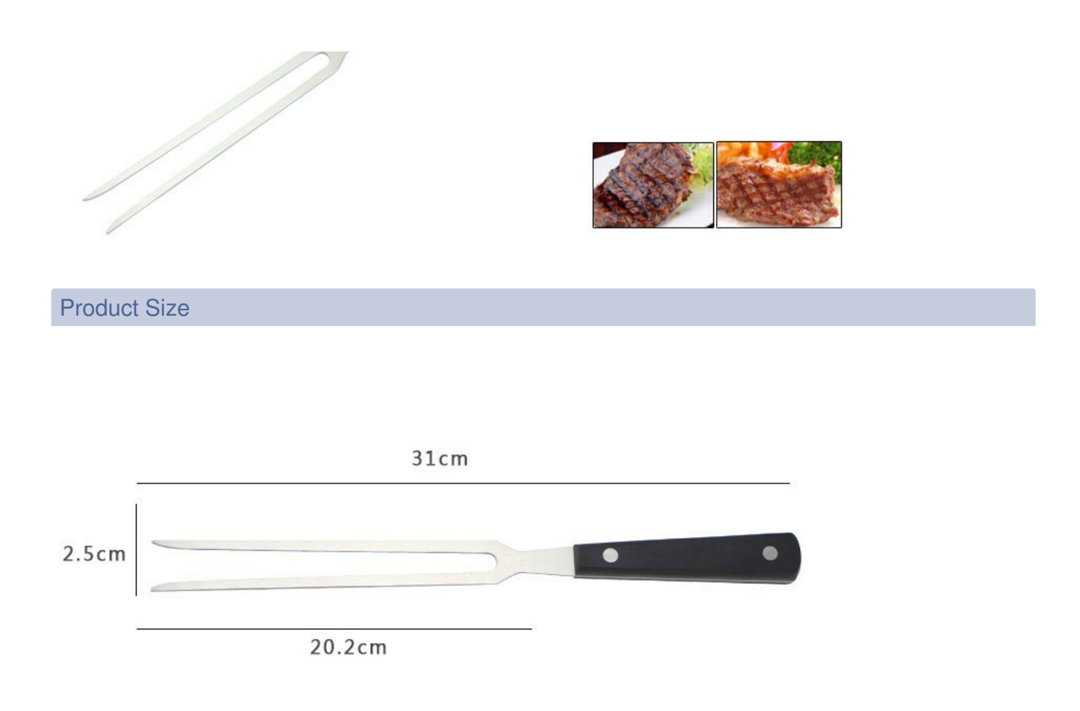
Blade THK: 2mm Note: Size is subject to actual sample.