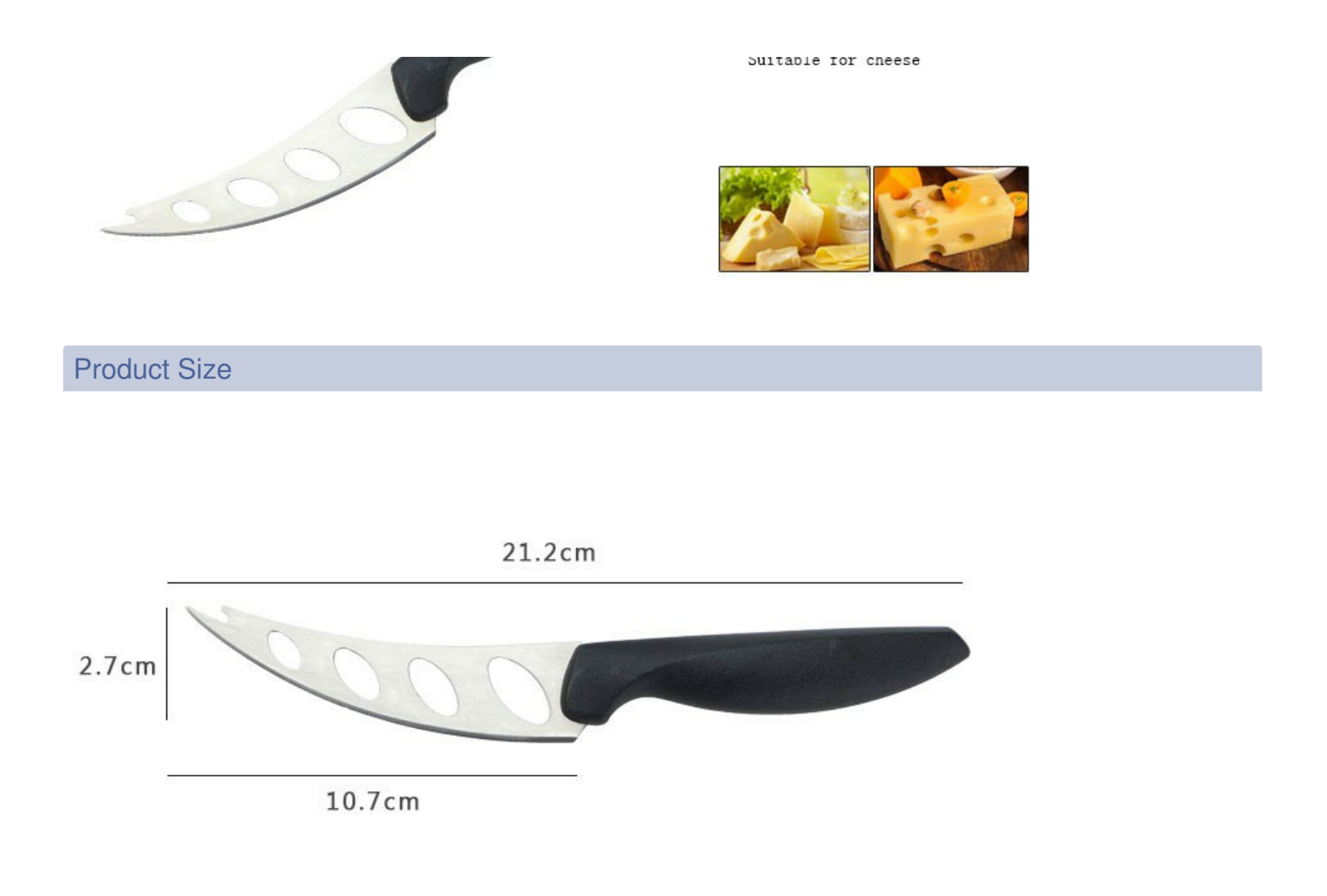
Blade THK: 1mm Note: Size is subject to actual sample.