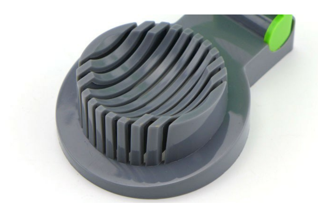
Opening and closing, is faster to cut egg

High quality plastic, food grade ABS material, it is safe and healthy, not easy to cause deformation