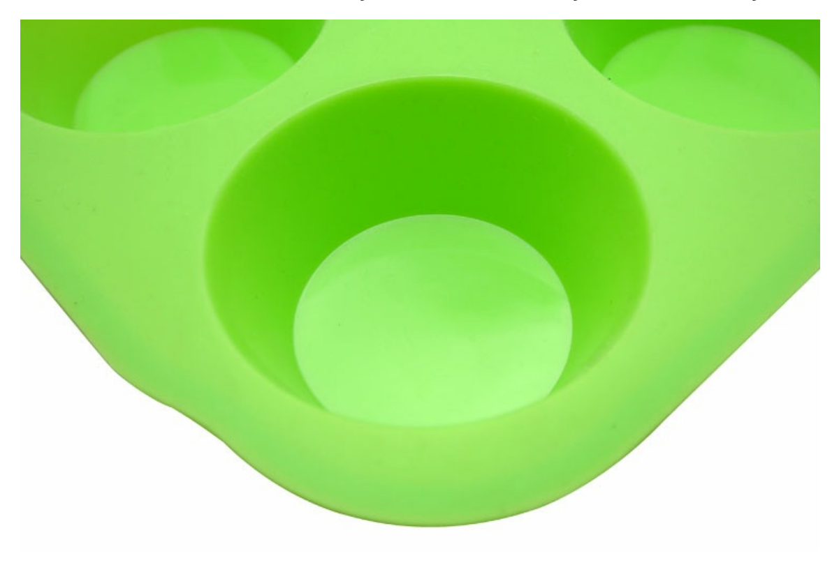
Lovely design, eye-catching.safe and durable, easy to clean.

Silicone material, non-stick and easy to demold.Eco-friendly, Low-Carbon, Recycled.