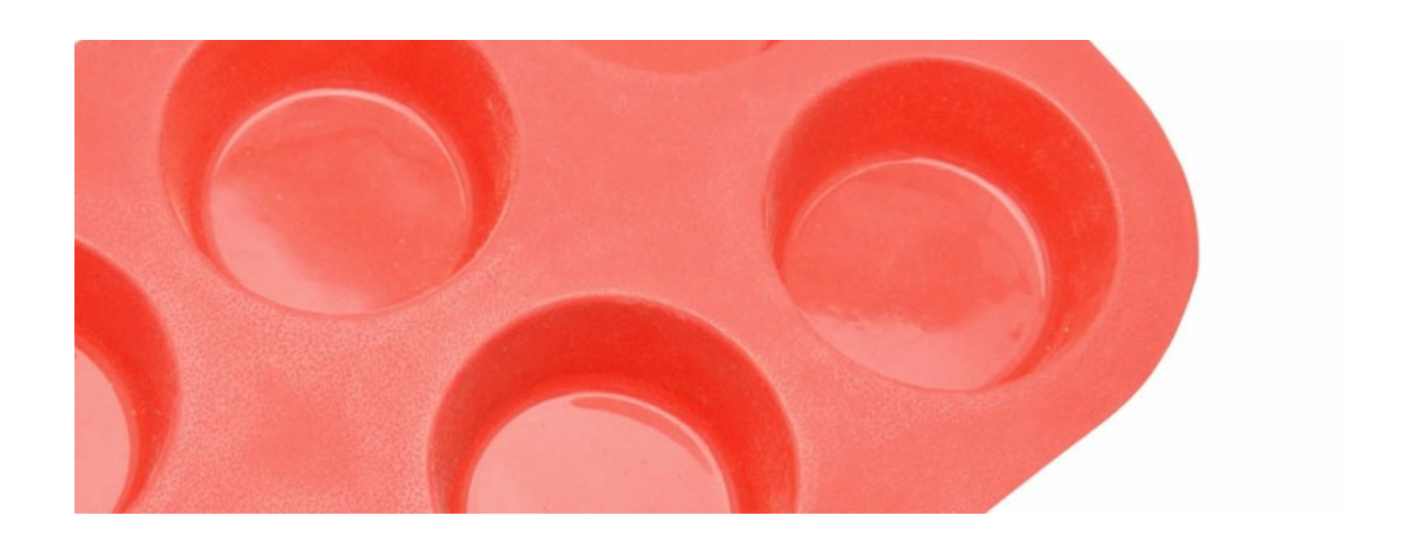
Silicone material, non-stick and easy to demold. Eco-friendly, Low-Carbon, Recycled.