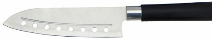
7" Santoku Knife