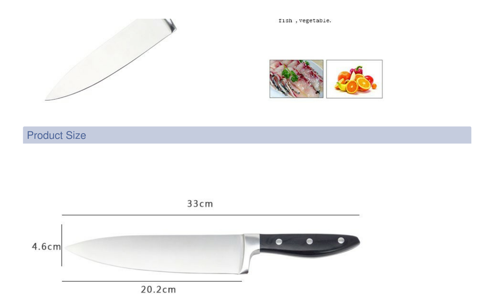
Blade THK: 2.5mm Note: Size is subject to actual sample.