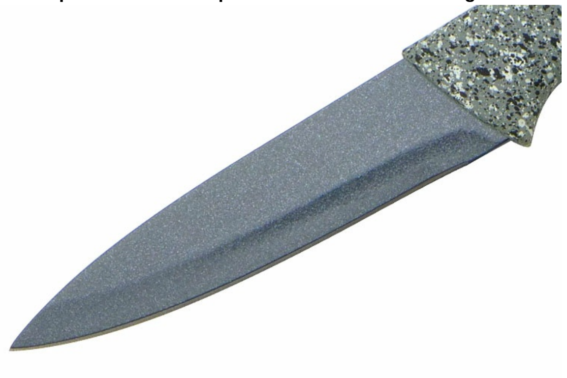
Soft-touch grip, more comfortable for holding.