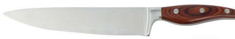
8" Chef knife