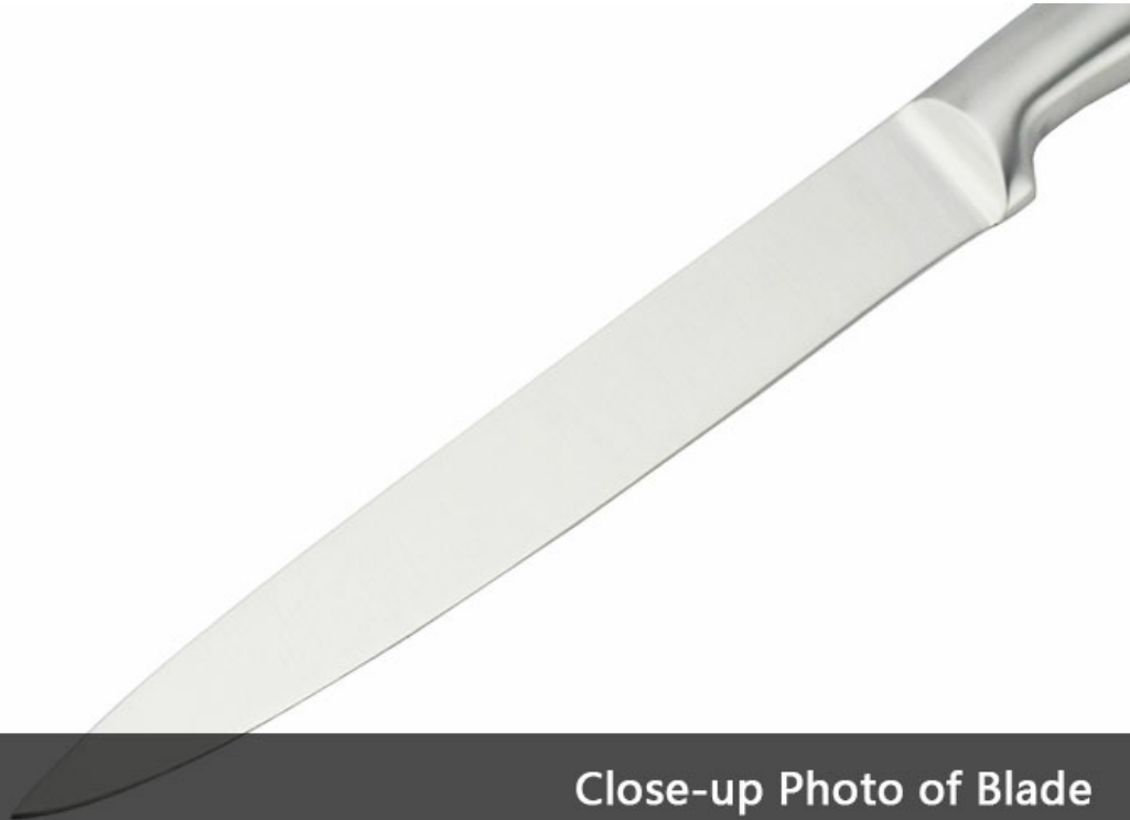
Close-up Photo of Blade

Made from 3Cr13, superior performance, sharp and durable