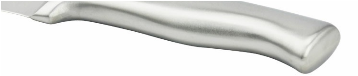
Close-up Photo of Handle