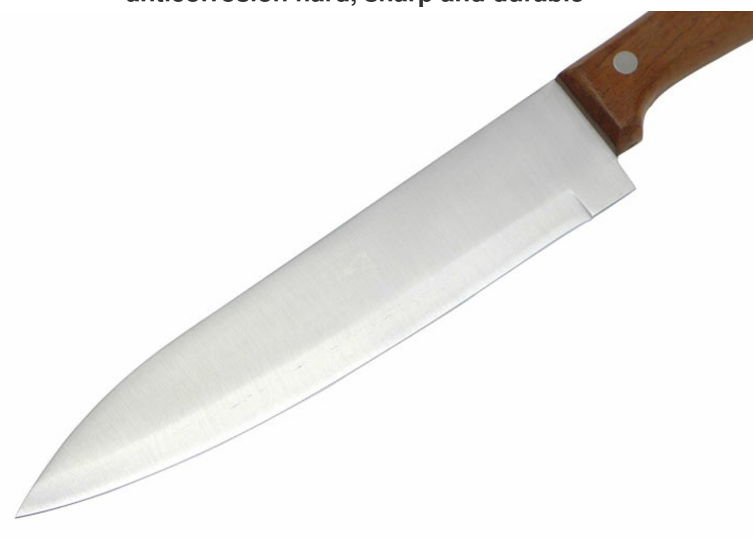
Fixed with 3 rivets, never break and crack, comfortable and anti-slip.

Treated at high temperature, makes the steel structure more stable and anticorrosion hard, sharp and durable