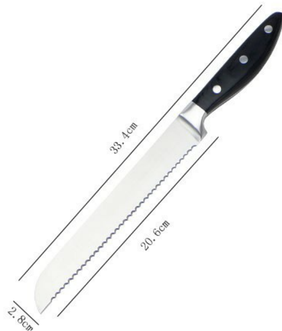
Product: 8" Bread Knife