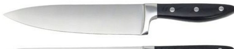
8" Chef knife