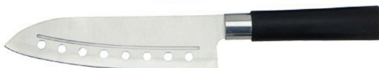
7" Santoku Knife