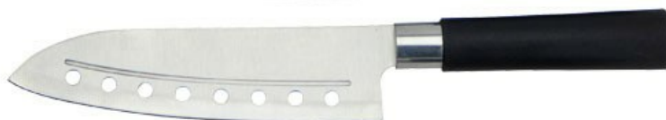
7" Santoku Knife